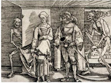
"Death and the Family" by Hans Weiditz (1532)