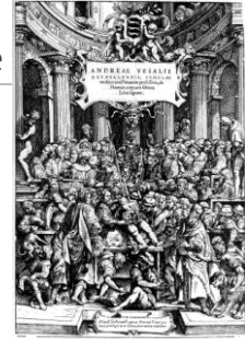
Frontispiece for De Humani Corporis Fabrica (1543), Vesalius