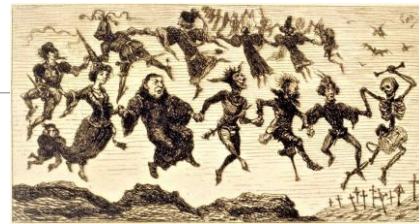
Death the Leveller