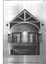
Designed by Inigo Jones for the Company of Barber Surgeons, 1636