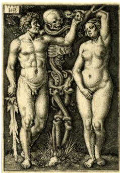
"Adam, Eve and Death" by Hans Sebald Beham (1543)