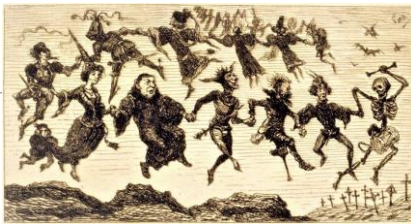
Death the Leveller