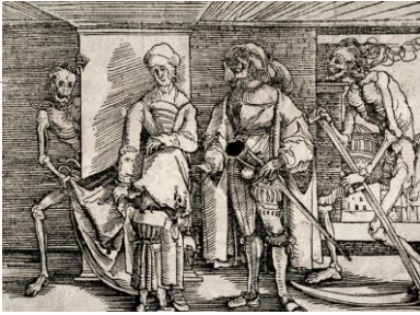
"Death and the Family" by Hans Weiditz (1532)